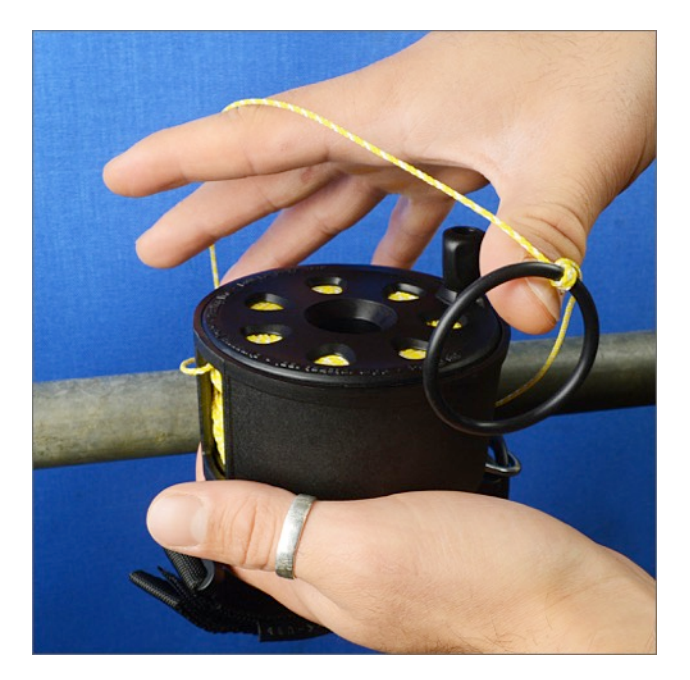
When using the reel for navigation: find a suitable anchor point and take a turn around it.