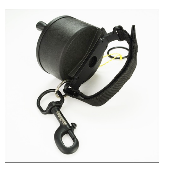
APD90: adjust the hand-strap to suit, using the Velcro webbing

APD45: adjust the wrist-strap to suit, using the spring toggle.