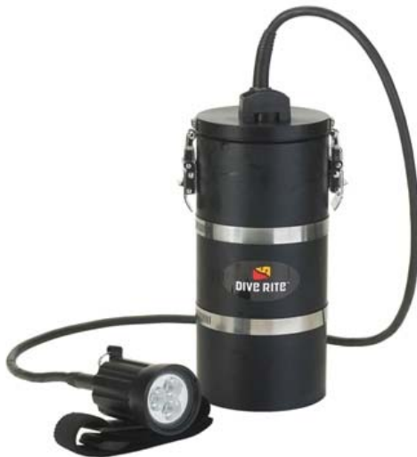
LT6500LED-LUX, Quest Canister

Charge the battery regularly. Put the battery on a charger at least once a month if it hasn't been dived. This will keep the battery conditioned and ready.