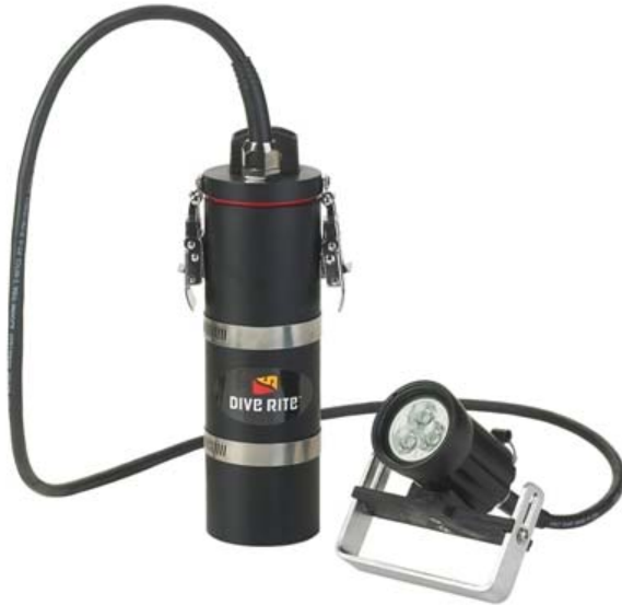
LT6250LED-LUX, Goodman Handle

The LED-LUX light has a compact LED light head with up to 1000 lumens of illumination, featuring the excellent robust nature of LED technology. The head has an attachment point for a clip so it can be clipped to a BC or harness, and comes standard with an elastic hand-mount or optional Goodman handle. The light is available with either the Slimline battery pack/canister or the Quest battery pack/canister.